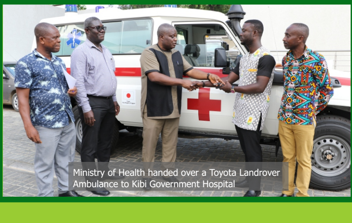
Ministry of Health handed over a Toyota Landrover Ambulance to Kibi Government Hospital