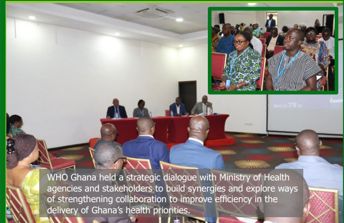
WHO Ghana held a strategic dialogue with Ministry of Health agencies and stakeholders to build synergies and explore ways of strengthening collaboration to improve efficiency in the delivery of Ghana's health priorities.