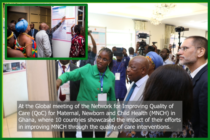
At the Global meeting of the Network for Improving Quality of Care (QoC) for Maternal, Newborn and Child Health (MNCH) in Ghana, where 10 countries showcased the impact of their efforts in improving MNCH through the quality of care interventions.