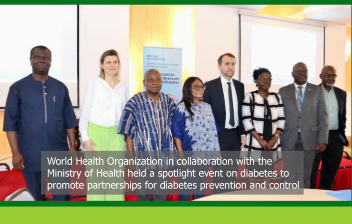
World Health Organization in collaboration with the Ministry of Health held a spotlight event on diabetes to promote partnerships for diabetes prevention and control