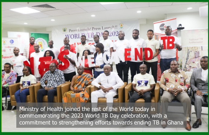
Ministry of Health joined the rest of the World today in commemorating the 2023 World TB Day celebration, with a commitment to strengthening efforts towards ending TB in Ghana